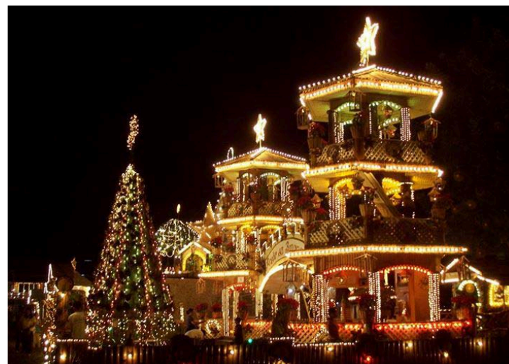
Bottom right: A Philippine 'parol' which is a pole with a lighted star at the top